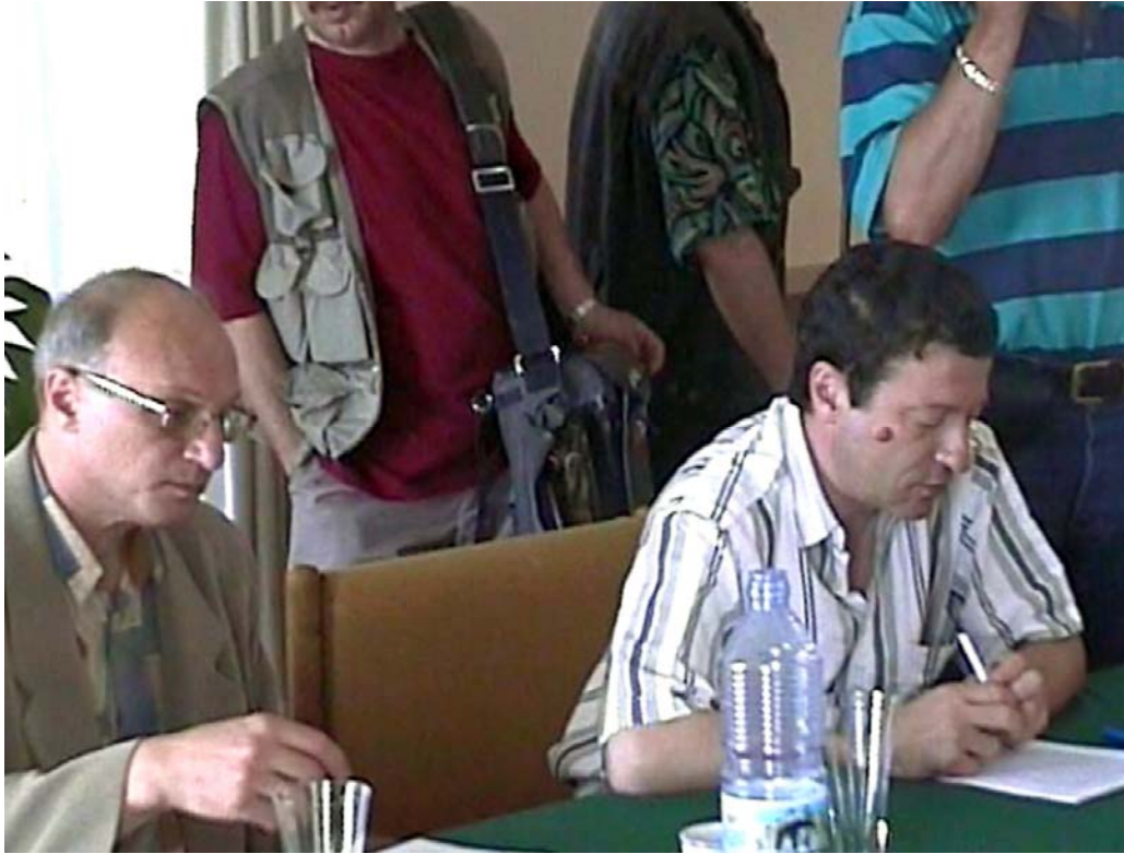
At the two-day seminar in Hisar