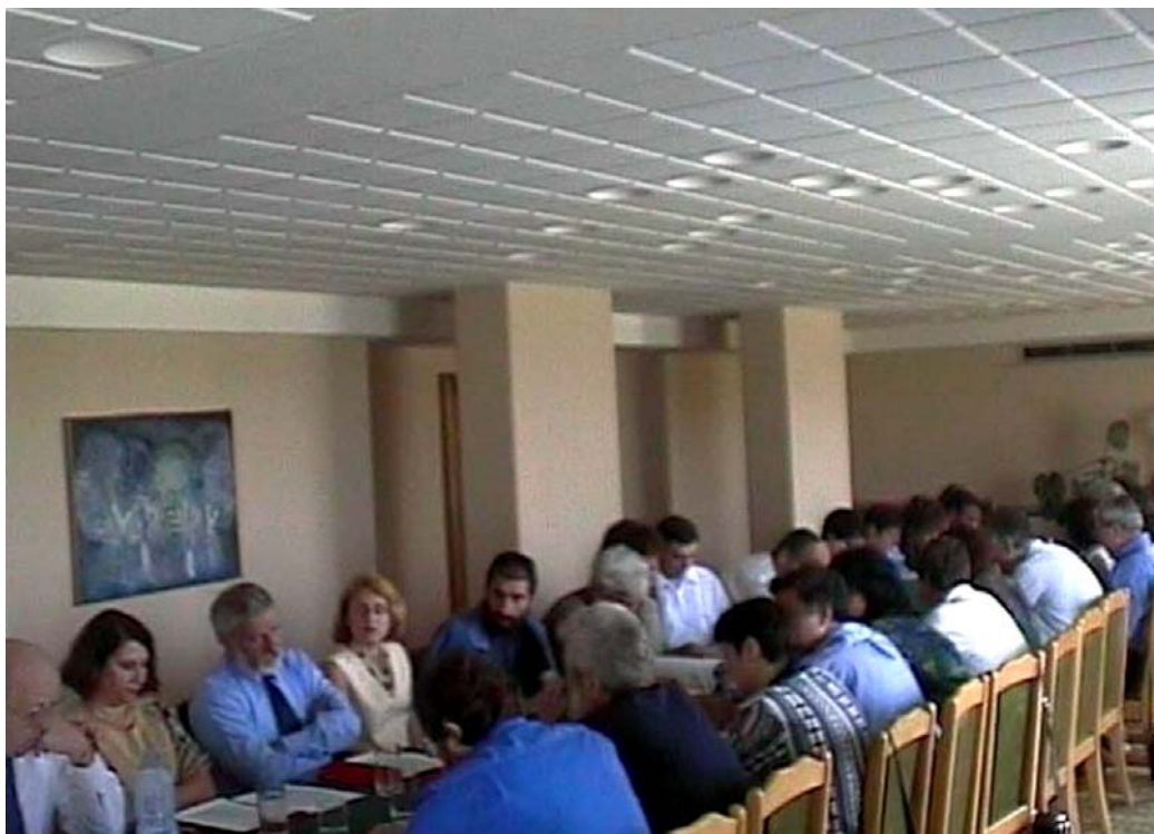
At the two-day seminar in Hisar