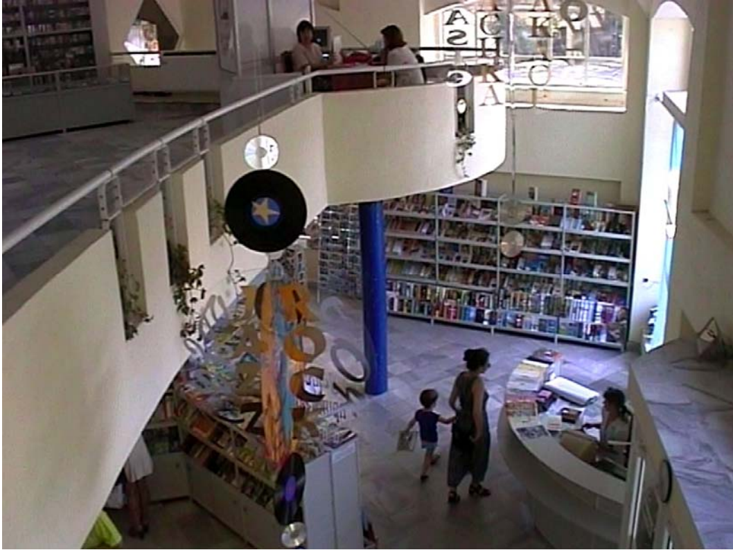
Look at the bookshop