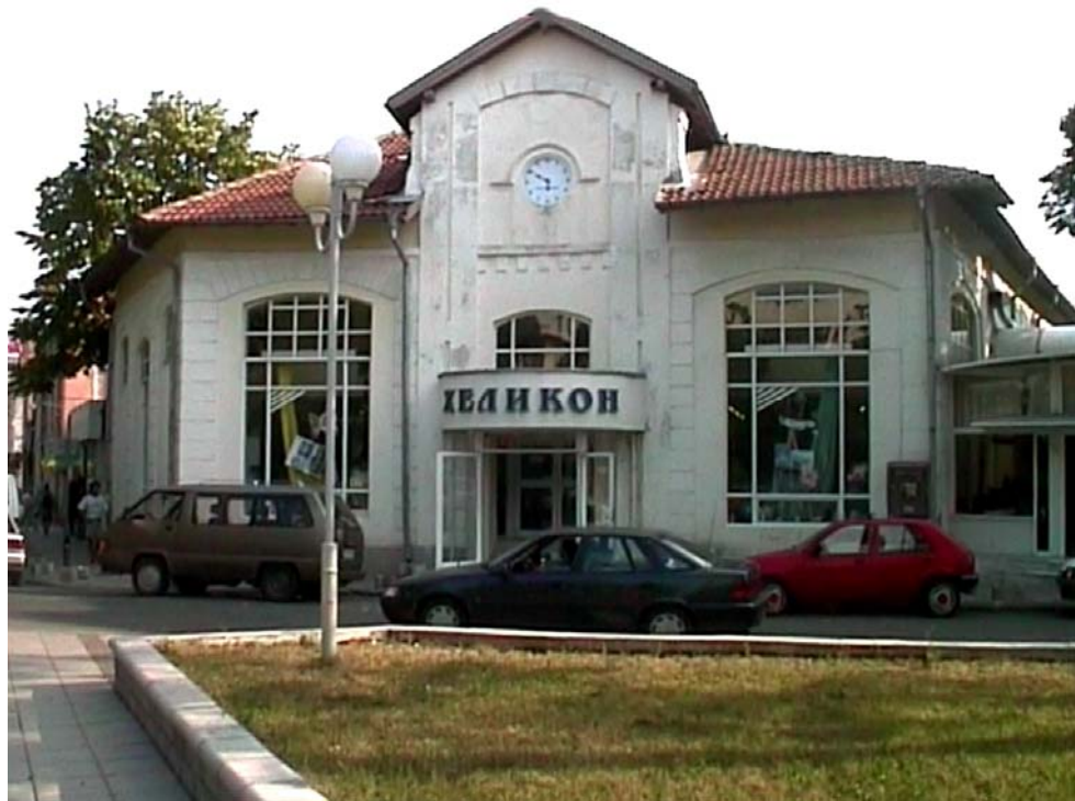
Visit to the bookshop "Helikon" in Bourgas